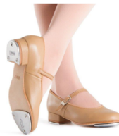
9 9.5 10 10.5 + 6 S03020 - Bloch Tap On Girls Tap Shoe $74.95 AUD Tan

Boys: Class wear (all styles) - Shorts (bike pants are better) and t-shirt are available from Kmart, but you can buy any brand.