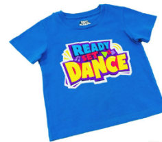
T SHIRT $25 each