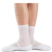
9 9.5 10 10.5 + 8 S02130 - Bloch Prolite II Canvas Boys Ballet Flat $34.95 AUD White