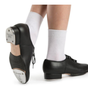
9 9.5 10 10.5 + 6 S03018 - Bloch Jazz Childrens Tap Shoe $119.95 AUD

Shoes from BLOCH Dancewear Manuka, but you can buy any brand.