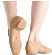
10 10.5 11 11.5 + 10 S04990 - Bloch Elastaboot Childrens Jazz Shoe $74.95 AUD Tan