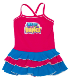
TUTU FRILL DRESS $45 each

Girls - pink ballet shoes with elastic, Boys - white ballet shoes with elastic