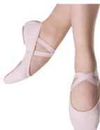
10 10.5 11.5 12 + 8 S02840 - Bloch Performa Stretch Canvas Childrens Ballet Flat $44.95 AUD Theatrical Pink