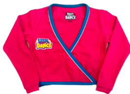
CROSS OVER $40 each