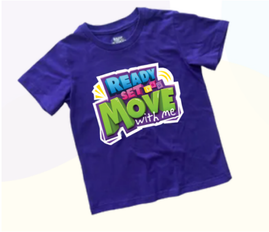
Ready Set Move T-Shirt $25

EXPRESS - involves free dance movement which develops creativity with instruments, feathers, and bubbles.