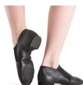
10 10.5 11 11.5 + 10 S04990 - Bloch Elastaboot Childrens Jazz Shoe $74.95 AUD