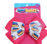
HAIR ACCESSORIES from $7.50