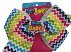
HAIR ACCESSORIES from $7.50