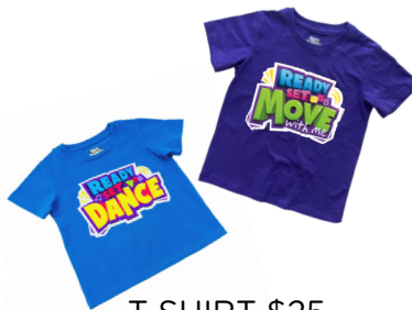
T SHIRT $25