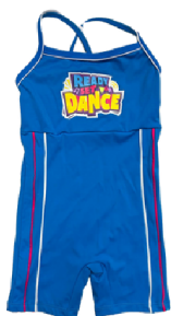
Dress or biketard $45

All Ready Set Dance, students will be required to wear the official uniform that we are sure you will love. Below are the following options that can be purchased at reception.