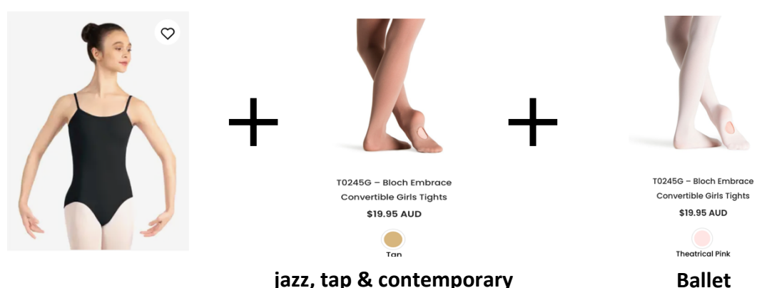
jazz, tap & contemporary

Girls Class wear (Jazz, Ballet, Tap) - Leotard, skirt, and tights available from Kmart, but you can buy any brand, or colour of leotard. Bike shorts may be worn for jazz, tap & acro instead of a skirt